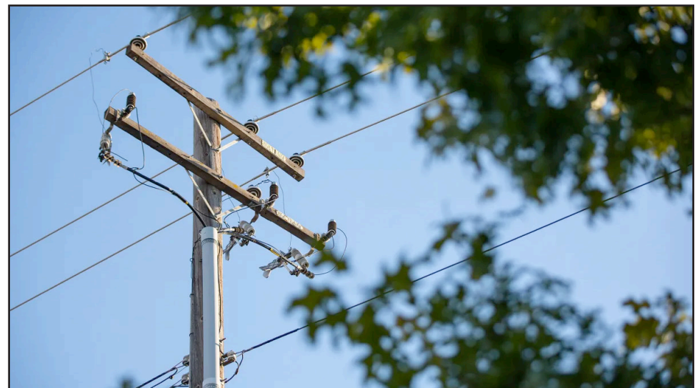
Power lines in Sacramento on Sept. 20, 2022.

Supporters say streamlining the state permitting process for electrical grid upgrades is sorely needed since California’s sweeping plan to end its dependence on fossil fuels by 2045 would increase electricity consumption by as much as 68%. That would put an immense strain on the state’s already blackout-prone energy grid. As it stands, large-scale grid upgrades regularly take five or more years